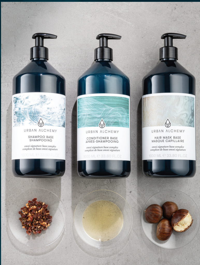
Back Bar Bases